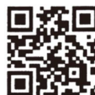
Kanazawa Nursery School Navigation